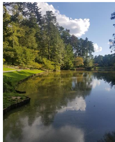
Around Duke University campus