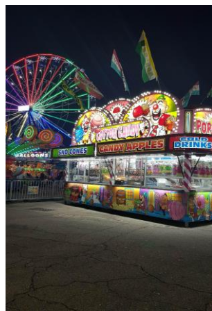
North Carolina State Fair