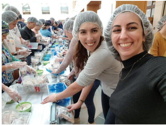
“Rise Against Hunger” campaign – volunteering event at Fuqua School of Business