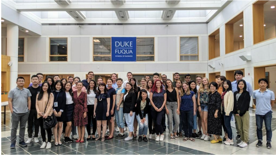
Group photo of the entire international student exchange program, Fall Semester 2019