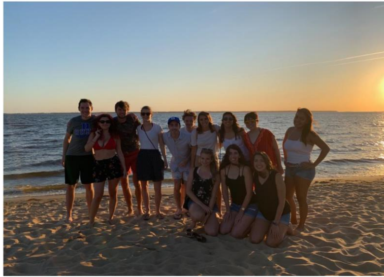
Weekend trip to Outer Bank, North Carolina