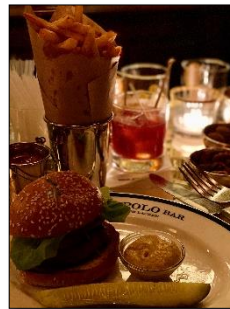
The Polo Bar