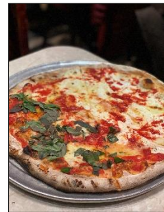
John's of Bleecker St