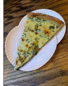
Artichoke Basille's Pizza