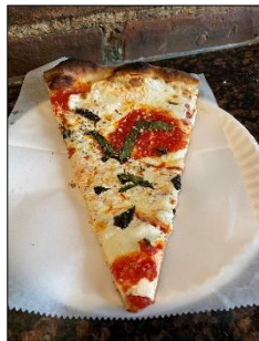
Prince St Pizza