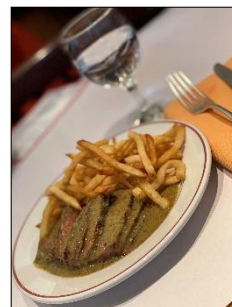
Le Relais de Venise L'Entrecôte