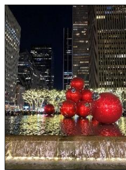
6 th Avenue near Rockefeller center