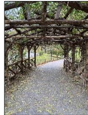
Bryant Park (see activities)