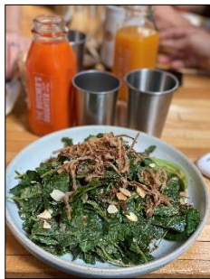
The Butcher's Daughter