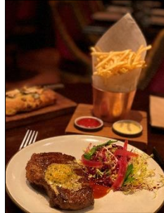
The Nomad ☼