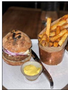
The Breslin (former ☼)