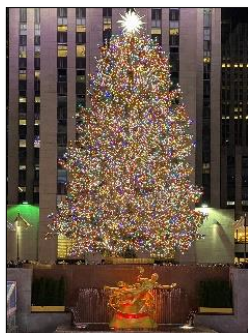
Rockefeller center tree lighting