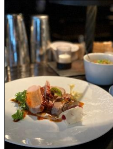
Gramercy Tavern ☼