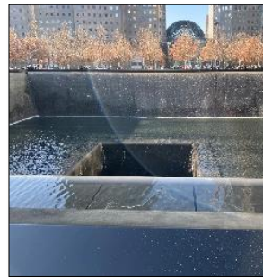
9/11 Memorial & Museum

Memorial – Free. Museum – $35. Free Admission Tuesdays (5 pm – close)