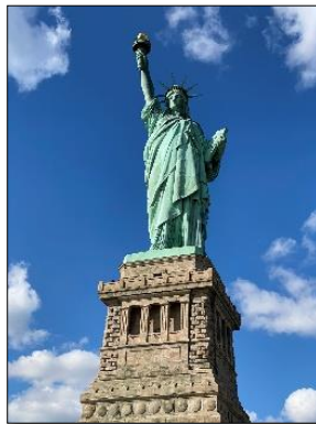
Statue of Liberty & Ellis island

book tickets up to two weeks in advance for $ 0.