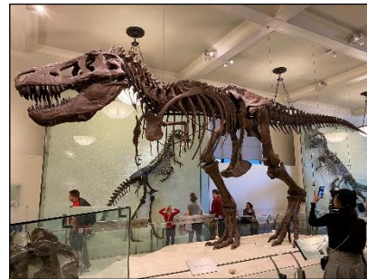
American Museum of Natural History

$18 suggested fee, or $ 27 for all the exhibitions, for students.