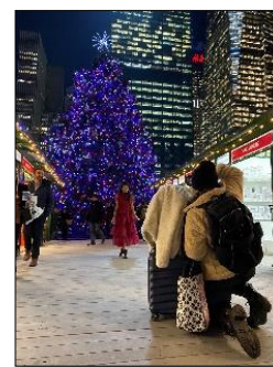
Festive market in Bryant Park