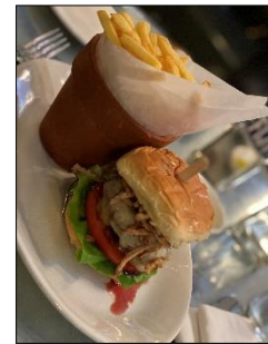
The Mercer Kitchen