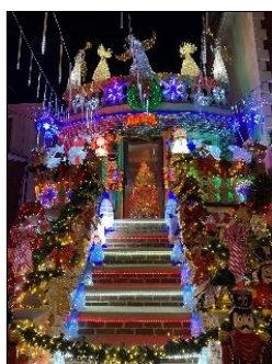
Dyker heights houses