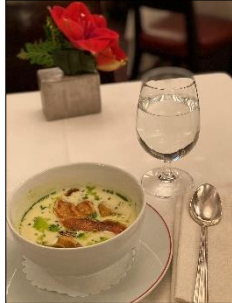
Café Boulud (former ☼)