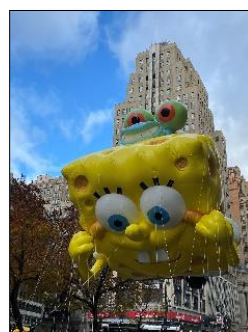
Macy's thanksgiving parade