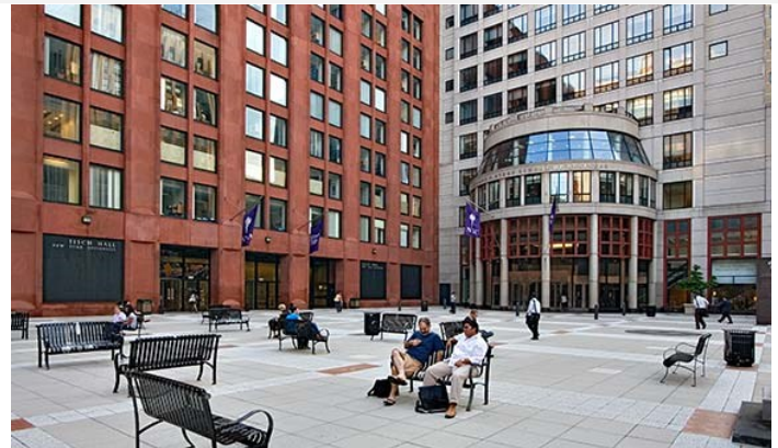
The Kaufman Management Center at NYU Stern